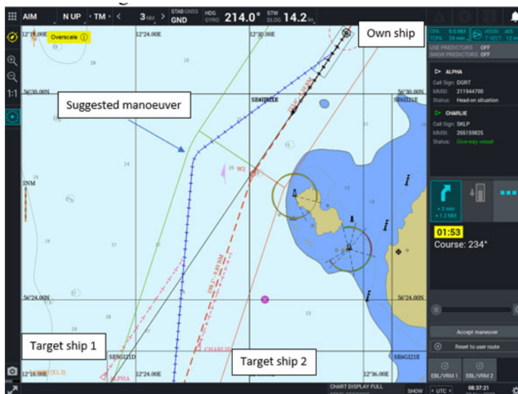
Figure 1. AIM user interface.